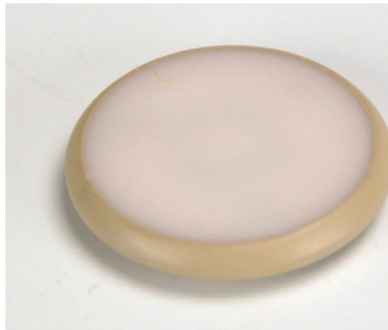
Plastic Coated RFID Chip Part # RFIDW

The synthetic slings will have a 5/8" diameter, plastic coated, high frequency chip inserted underneath the standard Tuff-Tag I.D. tag. A marker tape with "RFID" printed on it will stick out from the Tuff-Tag to make its presence obvious.