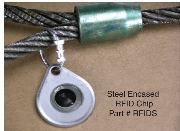
Steel Encased RFID Chip Part # RFIDS